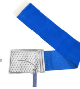
BACK & HIP (#LB)