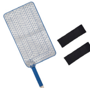
FULL CIRCUMFERENCE KNEE (#KBFULL)

"I had a total knee replacement and it's been so helpful. I have to say, this is a lifesaver – I love this product. I highly recommend this."