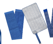
EXTENDED COVERAGE HIP (#HP)