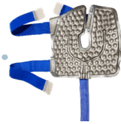
KNEE & JOINT (#KB)