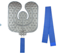
UNIVERSAL "U" (#UB)