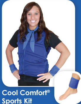
Cool Comfort® Sports Kit