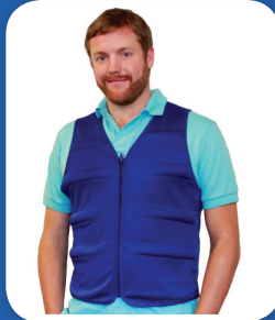
Cool Comfort® Performance Vest

1. "Precooling and Percooling (Cooling During Exercise) Both Improve Performance in the Heat: A Meta-analytical Review." British Journal of Sports Medicine (2014)