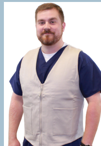
FASHION COOLING VEST